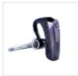
BT Wireless earpiece