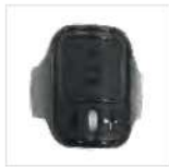
BT wireless ring PTT