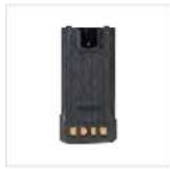
Li-polymer battery 2000mAh