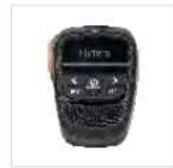
BT Wireless remote speaker microphone