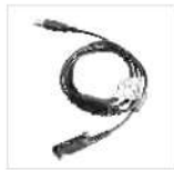
Programming cable (USB port)